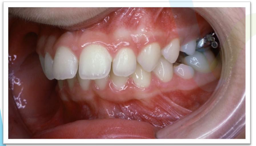
NOTE: Lip bumper was used in conjunction to Ortho-T®